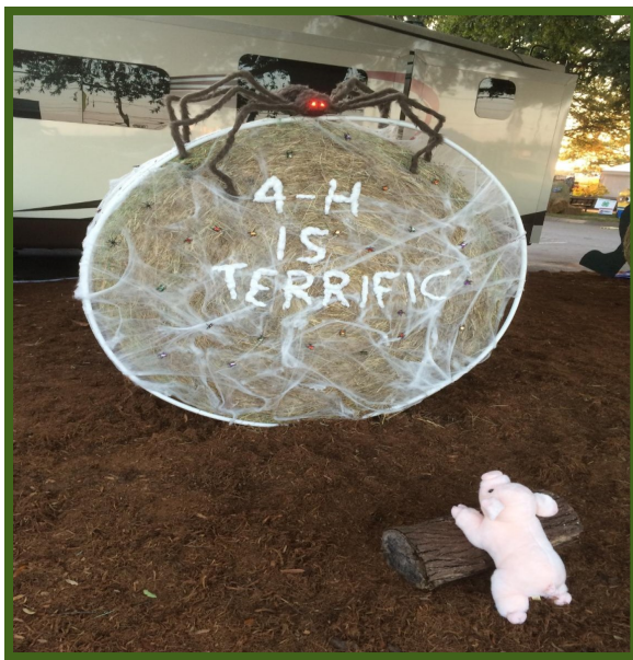
Wayne County 4-H Haybale at State Fair Contest

Even Charlotte and Wilbur thinks "4-H Is Terrific!!"